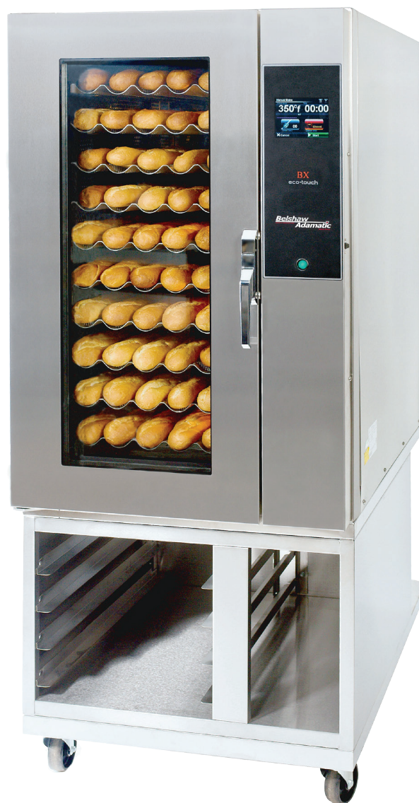
BX10 Eco-touch convection oven with 4-shelf stand. Shown with baguette racks (purchased separately).